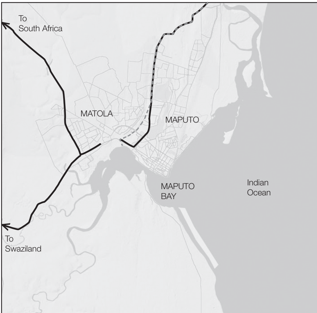
FIGURE 1: Location of Maputo and Matola

— Main roads - - - - Matola/Maputo boundary