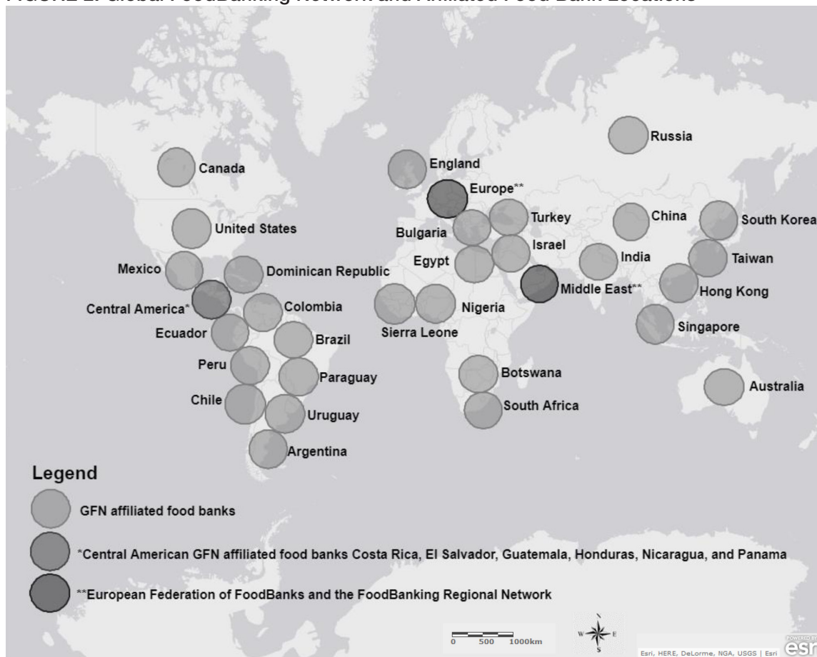
FIGURE 2: Global FoodBanking Network and Affiliated Food Bank Locations